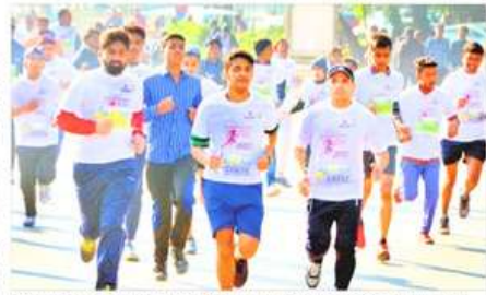
People participate in a half-marathon, "Run for Ladli", in New Delhi on Sunday.

TRIBUNE NEWS SERVICE NEW DELHI, DECEMBER 17 The Delhi Police in association with NGO Ladli Foundation organized a unique half-marathon for the cause of "women safety" named "RUN for LADLI" from Jawahar Lal Nehru Stadium to Central Park, CP today. The marathon was organized to support a social cause to spread awareness towards gender equality and to stop crimes against women. The Home Minister, Rajnath Singh, who flagged off the run, administered oath to everyone present on becoming savior of girls and